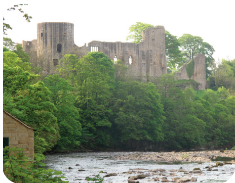
View of Barnard Castle from the River Bank

Follow the path round to the right and cross the first wooden bridge on the left over Percy Beck coming to the open grassy area. This is known as the Band Stand since the time when concerts were held here in Edwardian times. Follow the footpath along the side of the river for about quarter of a mile. The path then splits, but soon joins up again. Take care when it splits a second time and keep to the left, as a steep stone-stepped path up to the right leads to the remains of the Tees Railway Viaduct. This was built in 1861 and carried the line from Barnard Castle to Middleton and Kirby Stephen via Stainmore.