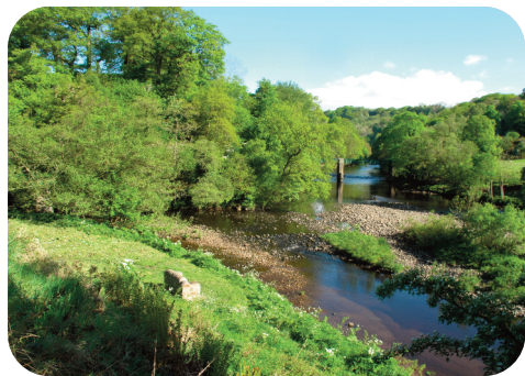
Confluence of Rivers Tees & Balder

along the path and soon through a wooden gate to a farm track. Continue to the left along this track, then after 100 yards left again following the path down and through a wooded, disused quarry. In spring this is full of the smell of wild garlic. Go through the gate and keeping the river on your left, cross the field to a wooden footbridge over Lance Beck. Follow the steep path up the field towards Cooper House, following the waymarkers. Go through the gate to the right of the buildings and follow the wall until reaching a footpath gate on the left. Go through this and crossing the field diagonally, go through a gate and continue to another gate by the wall next to some barns.